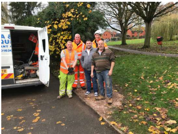
Some of the volunteers from Tarmac and A&V Squires.

This will be done by courtesy of Tindle Tree Care .