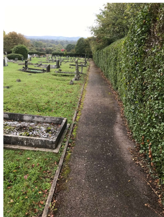
Right hand path from mid-way - down