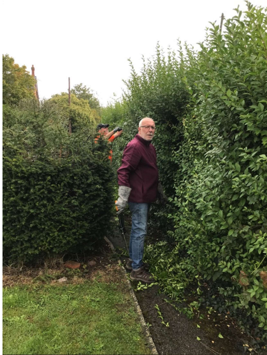
Hedges really overgrown!