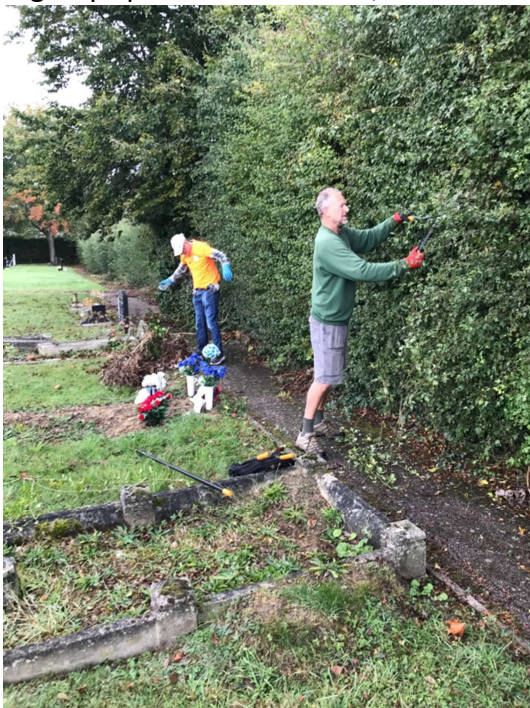
Sizable hedges to tackle for the team

The group split into two teams, one for each path, and made a start!