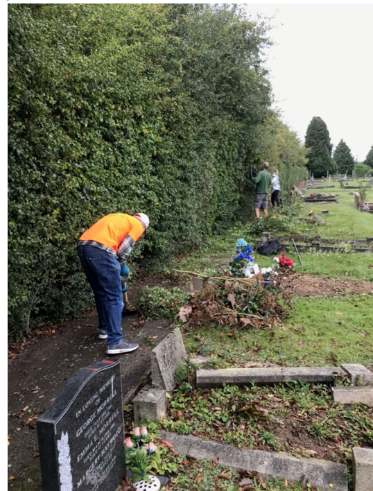
Lots of path debris to clear too

There was a considerable part of the right hand side path completely blocked by the overgrowth, plus lots of Ivy and moss that also needed to be removed from along the paths. The team here did a fantastic job to cut it all back and re-open the path for everyone to use.