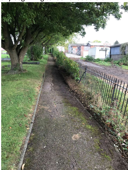
Left hand path from the bottom - up

Liz was busy doing a litter pick around the cemetery. Lots of blown plastic wrappers from floral tributes were found and it wasn't long before 2 big bags of litter were collected. It was really beginning to look a lot tidier!