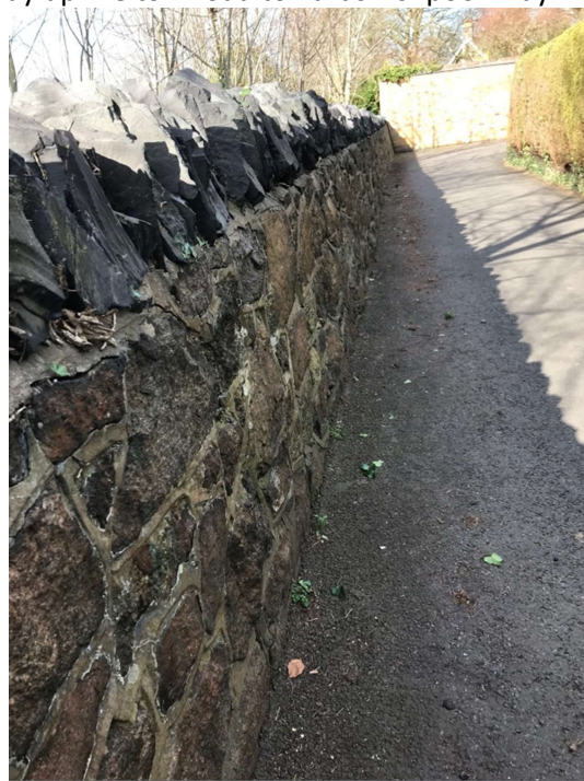
All cleared away as we left