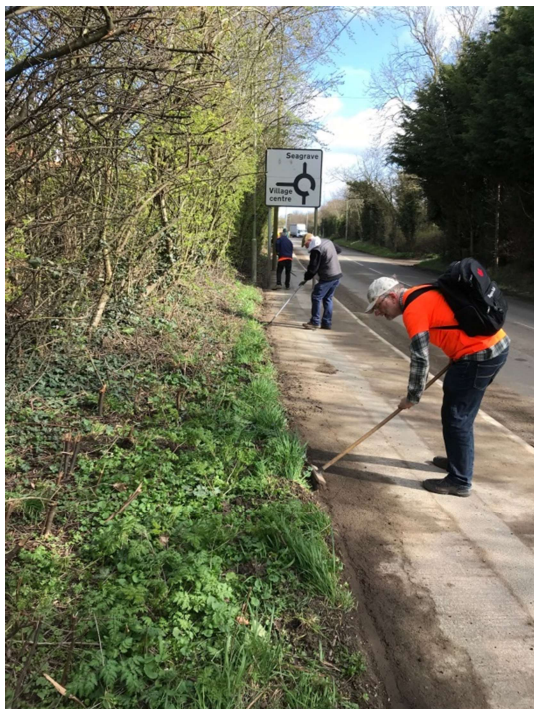
Finding the inner edge of the path under all the soil from leaf debris and recent weather

Lots of soil was removed from the inside of the pavement to restore it to its full width once again.