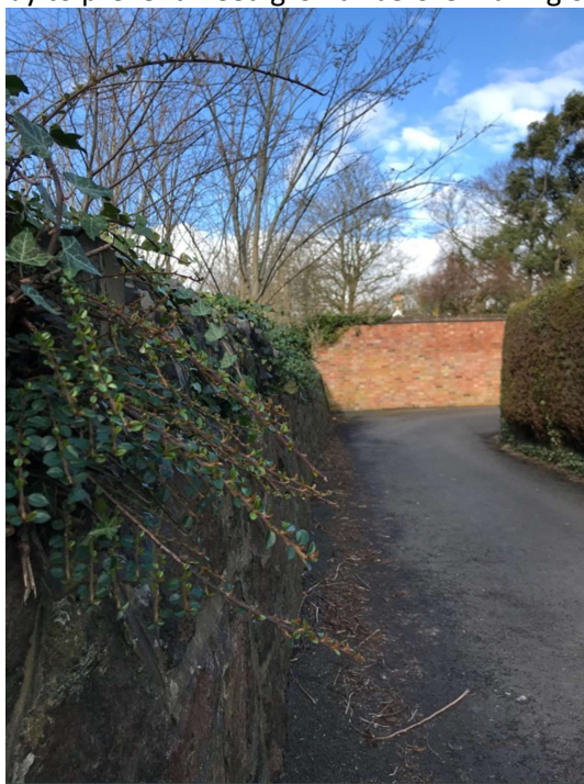
Ivy and leaf debris on arrival

A bright, sunny but chilly start before a quick shower brought ominous grey clouds and a sharp rain shower. Luckily we persevered and were rewarded with blue skies once more and a warming wind. A relatively short stop in Shooting Close Lane to keep the wall clear of ivy and sweep the leaf debris away to prevent weed growth before making our way up Melton Road towards Fishpool Way.