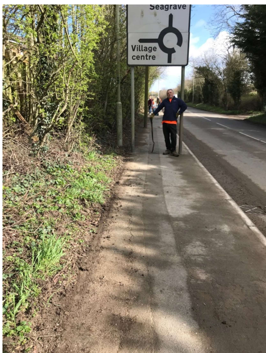
Andy having a bit of a pose under the newly cleaned road sign

Thanks again to all our volunteers for another great turn out and lots of hard work today