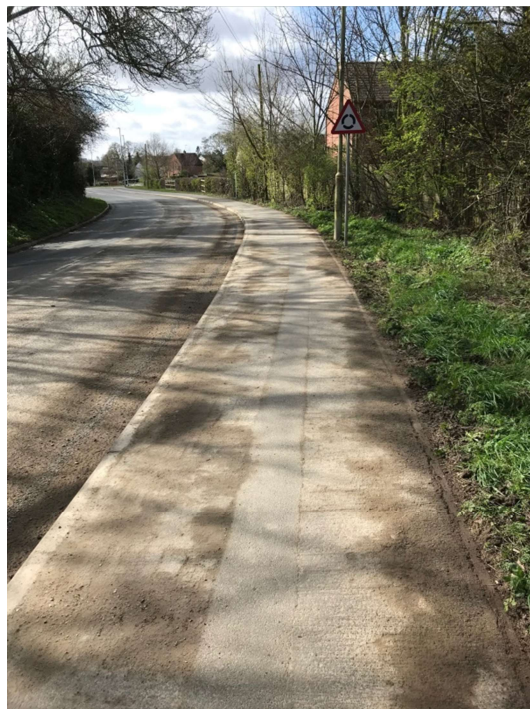
Looking back after the path was cleared and the full width can be seen once again