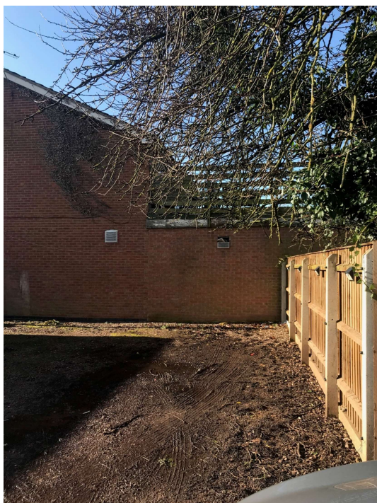
Before: Tree with lots of low branches and rubbish all blown into the corner area

A lovely bright and sunny day today. We started in the Library carpark with some litter picking and also trimmed down some overhanging branches from the tree. This has caused a lots of leaf debris/mud to form underneath so we tried to clear as much of that away as possible whilst leaving the gravel in place. In total 2 really full brown bins of branches removed. This area should be a little easier to park in now.