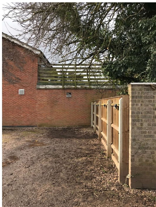
After: All the low hanging branches removed as well as the rubbish.