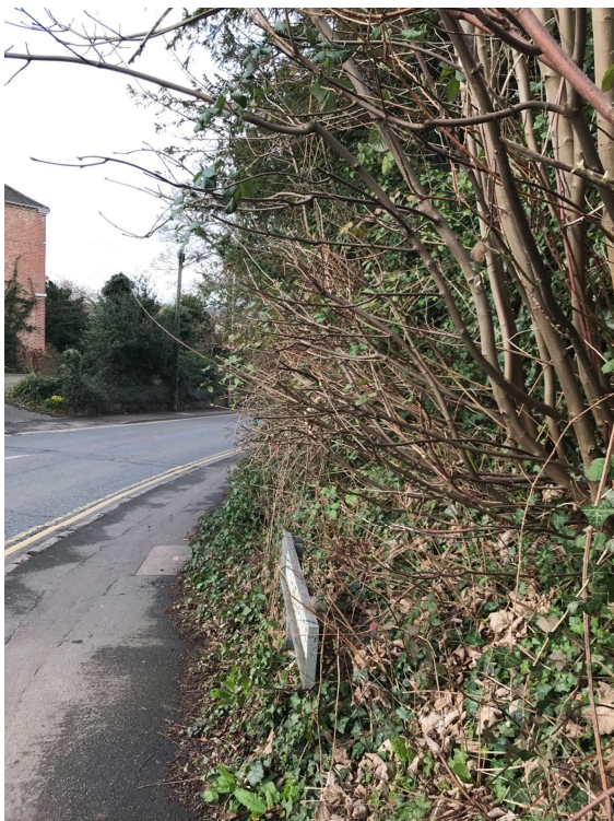
From High St Before