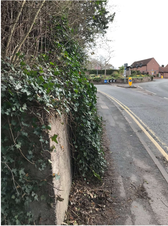
From Bridge St Before