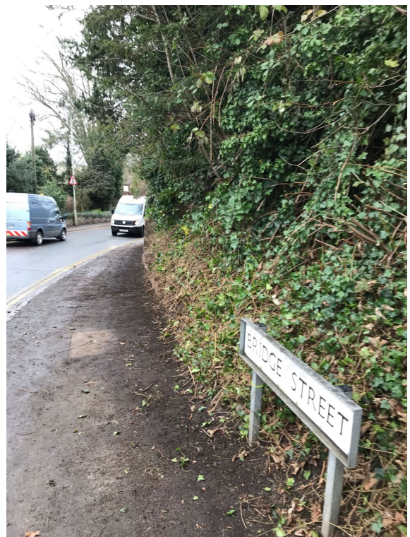
From High St After clearance