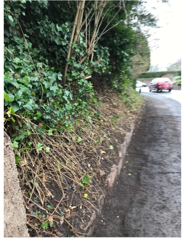
Bridge St After Clearance