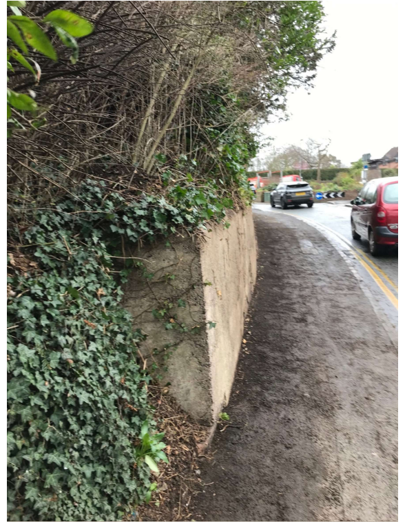
From Bridge St After clearance