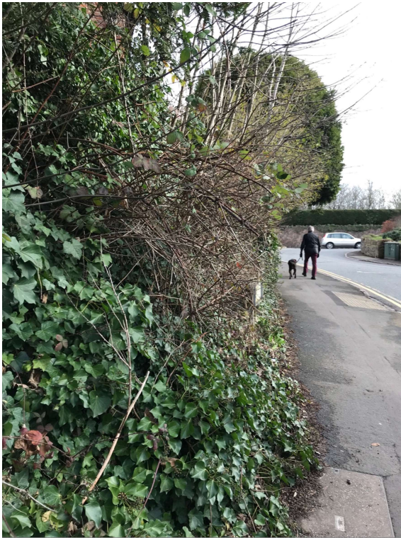
Bridge St Before