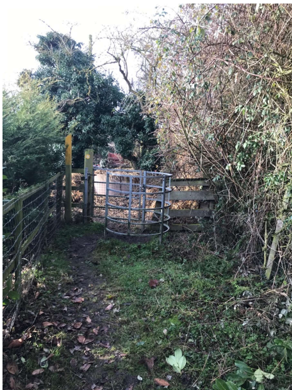
Gate after clearing away overgrown brambles