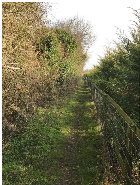
Footpath looking towards Walton after clearing overgrown branches and brambles