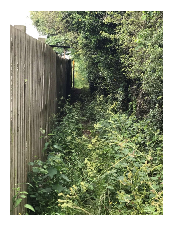
Alongside Cricket Clubhouse Before