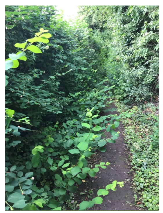
Behind Cricket Pitches Before