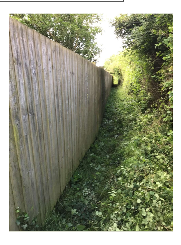
Alongside Cricket Clubhouse After