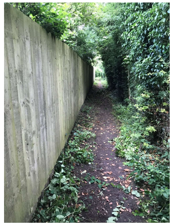
Behind Cricket Pitch After