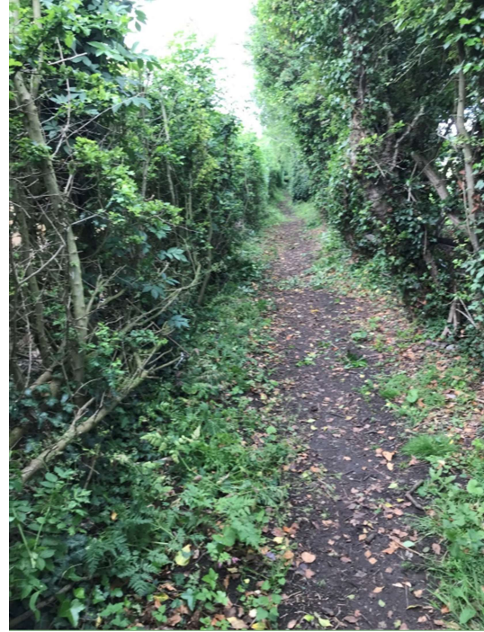
Behind Cricket Pitches After