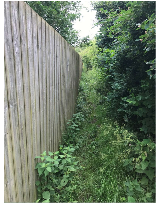
Behind Cricket Pitch Before