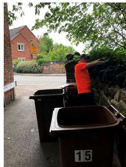
Tee shirt weather finally