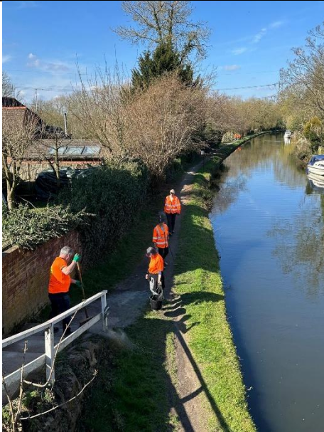
Almost finished - back at Mill Lane