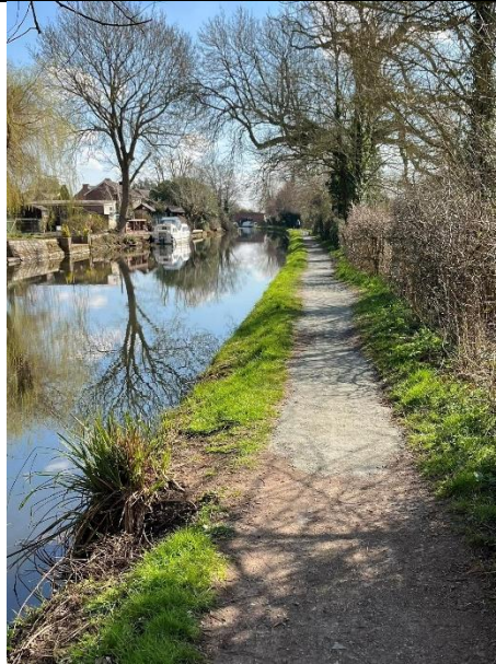
New surface - looking towards Mill Lane end