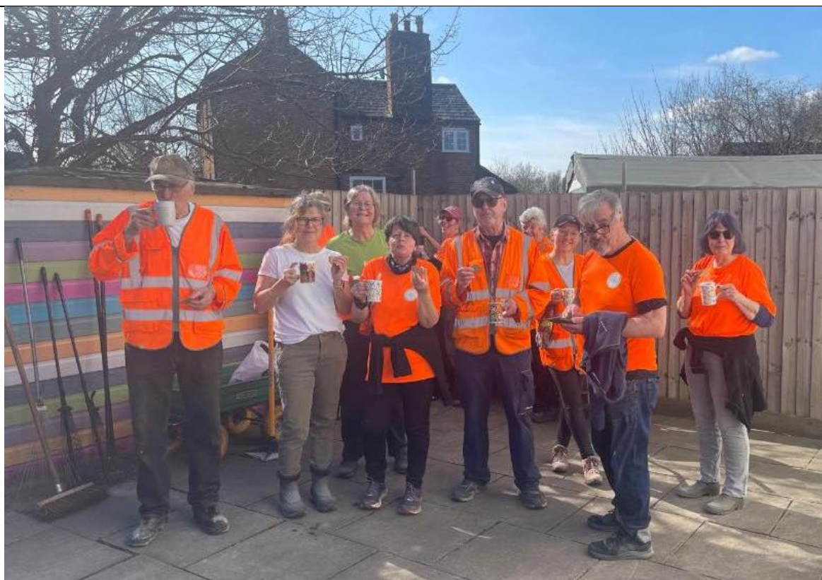
Most of the team - enjoying a brew and biscuits

The tea and biscuits at the end were most welcome. Thanks to The Canal and River Trust for the materials.