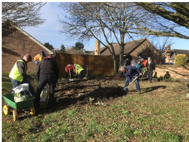
Lots of Digging

We were asked to move the remaining plants and bulbs from the old garden around the area and remove the soil to ground level with grass seeds will be sown shortly.