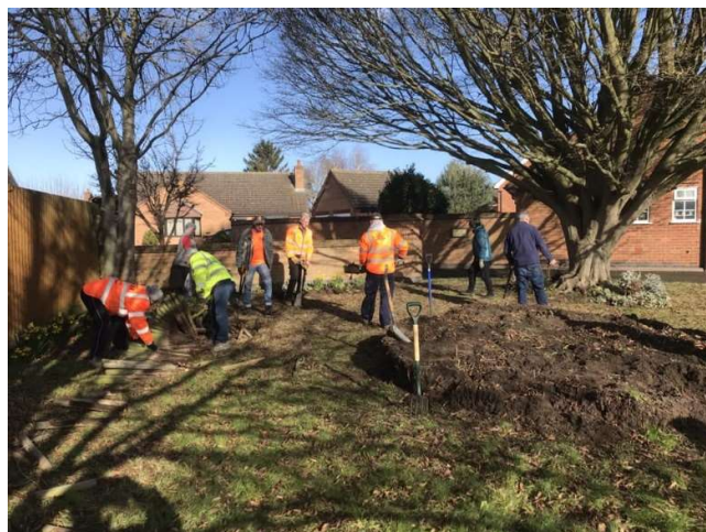
Still more digging