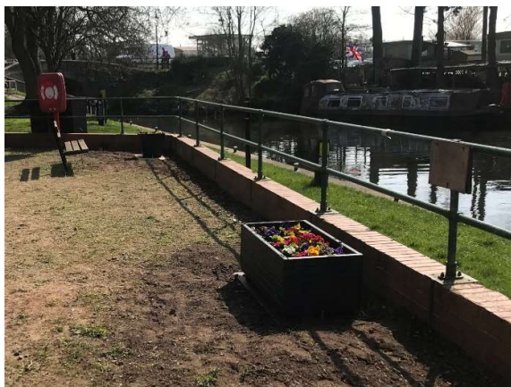
One of the new large planters in place looking towards Deep Lock