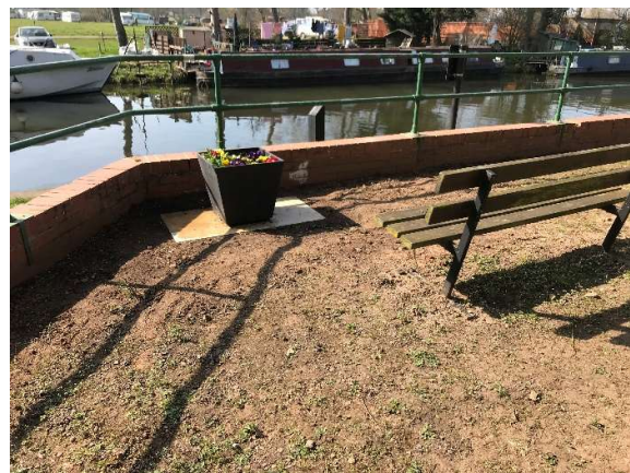
One of the small planters in place looking towards 'The Slabs'

The planting up was done after our tea break and what a difference it has already made. In time the annuals will be replaced with longer lasting perennials when they become available to provide summer long colour.