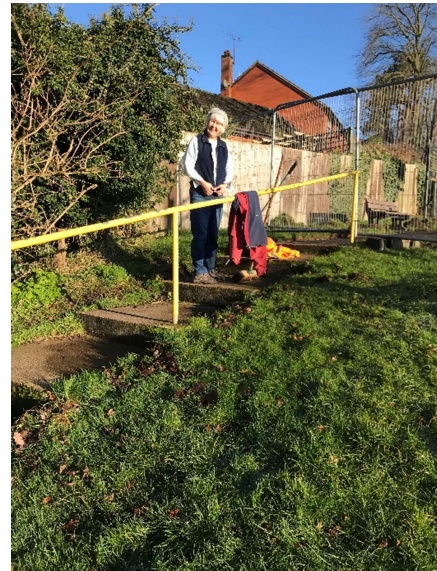
Julie having to take off a couple of layers of clothing as the sun came out